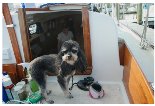
Phantom, the working SEA DOG!

"This summer, I'm excited to offer private and semi-private yoga instruction on land and aboard Hado!